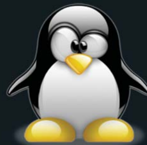
Tux Designed by Larry Ewing

atlas GMV® provides synchronization of PIM objects through the SyncML (Synchronization Markup Language) standard of the Open Mobile Alliance (OMA).